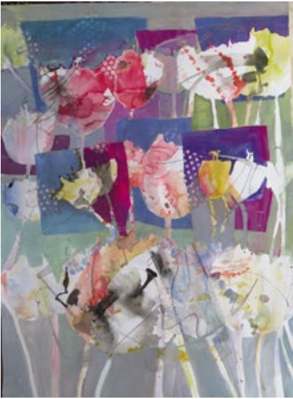
Teresa Kirk Pembroke Pines, FL In Search of Symbols XXXV 30" x 21" $1,500