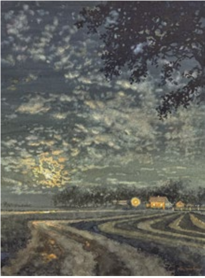
Mark Mohr Roeland Park, KS Nocturnal Farm 20" x 15" $2,600