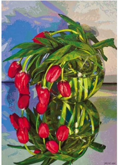
Elizabeth Yarosz-Ash Wichita Falls, TX Lynn's Tulips 14" x 10" $1,750