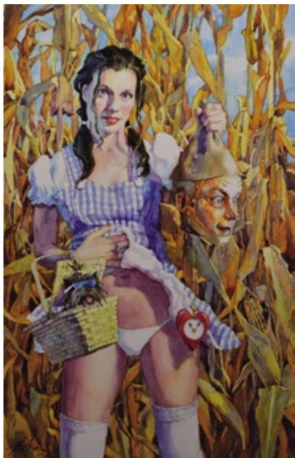
Lance Hunter Tahlequah, OK If I Only Had a Heart 27" x 17" $4,700