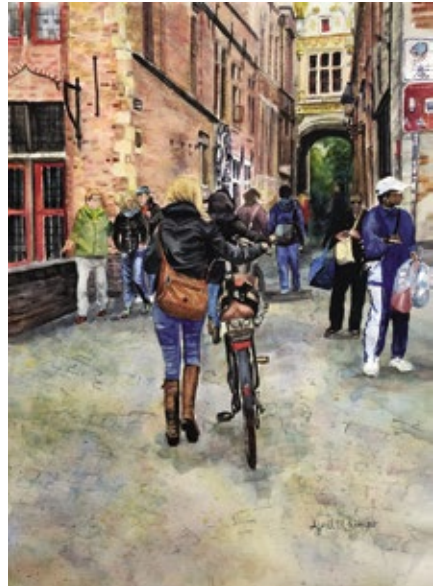
April Rimpo Dayton, MD Modern Footsteps in Medieval Cobblestones 20.5" x 14.5" $2,100