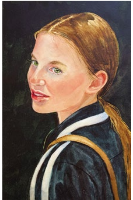
Mel Lacki Pleasanton, CA Julia 15" x 12" $4,300