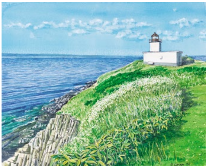
Gregory Larson Overland Park, KS Cape d'Or - Bay of Fundy 14" x 17" $1,200