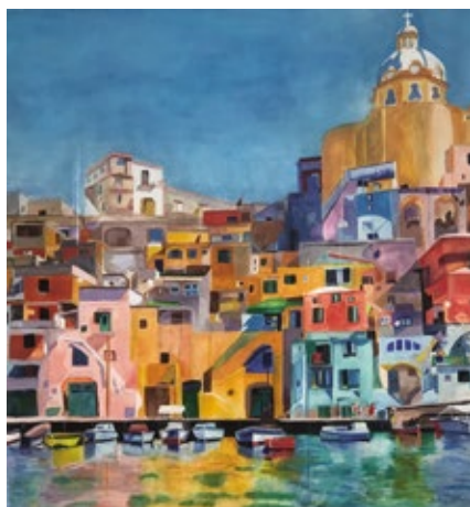
Barbara Bottenberg Wichita, KS Dreaming of Italy 30" x 30" $750