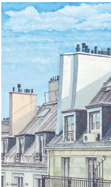
Gregory Larson Overland Park, KS Paris Rooftops 20" x 12" $1,200