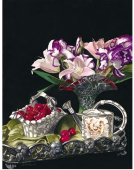
Linda Pickwick Newtown, CT Silver Settings 24.5" x 18.5" $3,450