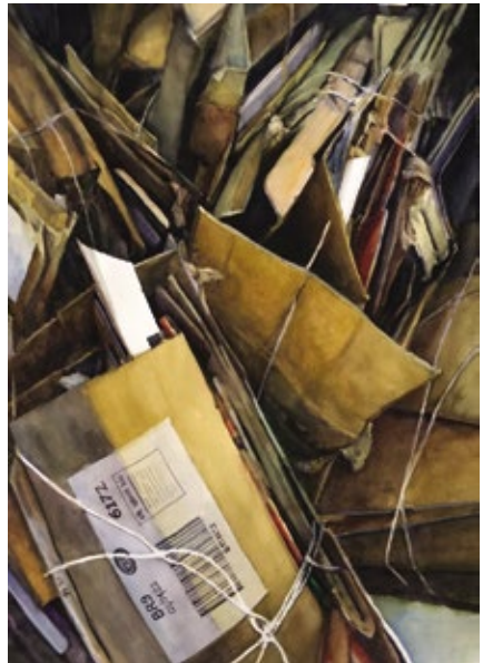
Richard Estrin Brooklyn, NY Precious 1 30" x 22" $1,800