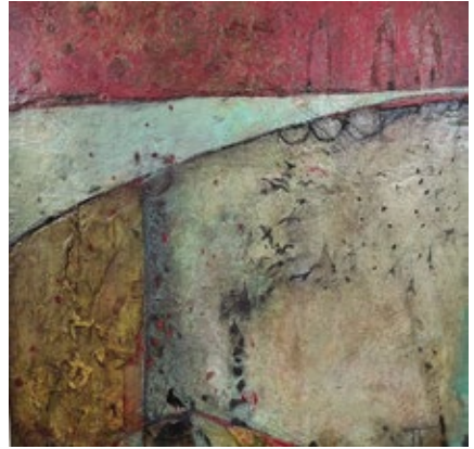
Janet Fisher Wichita, KS Spirit In the Sky 16" x 16" $700