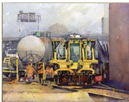
Richard Sneary Kansas City, MO Track Repairs 11" x 14" $1,400