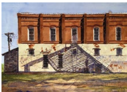
Gaylord O'Con Dallas, TX Grand Saline TX Morning Shadows 17" x 24" $1,400