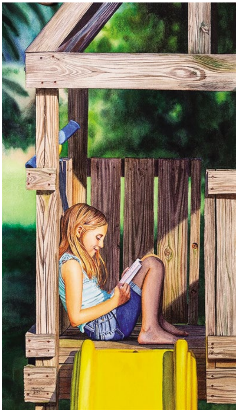
Matthew Bird Magic Treehouse 20" x 13" $3,000