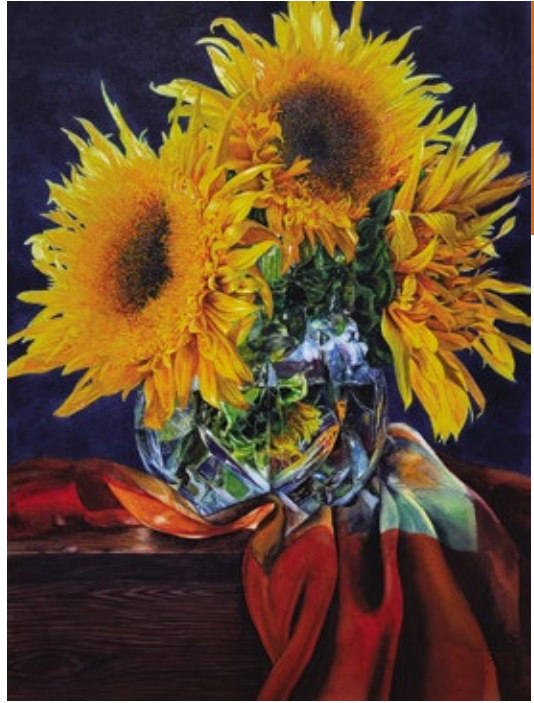
Soon Warren Fort Worth, TX Sunflowers 30" x 22" $7,000