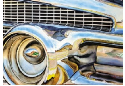
Larry Cullins Salina, KS Dagmar 28" x 40" $1,000