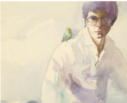
Lori Eslick North Muskegon, MI In the Distance 11" x 14" $445