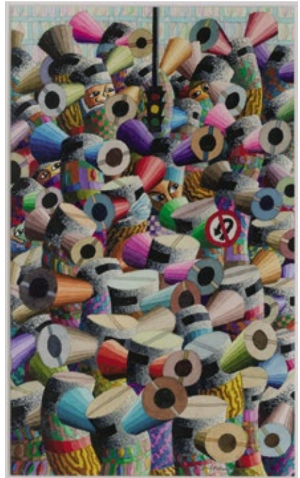
Wayne Conyers McPherson, KS Too Many People, But Cautiously Moving Forward 12.75" x 8" $3,000