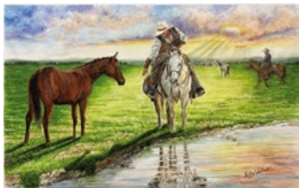
Kathy Waltner Moundridge, KS Let's Go Home 13" x 20" $1,400