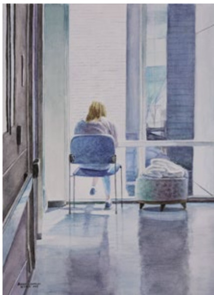
Brent Langley Edwardsville, IL Hospital Vigil 16" x 12" $1,500