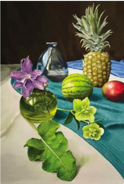
Craig Lloyd Cincinnati, OH Spring Still 26" x 17.5" $800