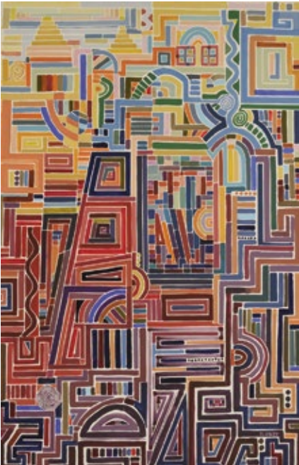
Norman Carr Wichita, KS Encyclopedia of Lines and Shapes No. 2 25" x 16" $1,400