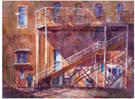
Nel Dorn Byrd Aubrey, TX Back Alley Gainesville 22" x 30" $3,000