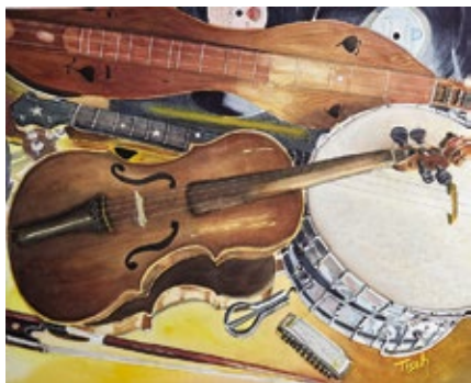
Lance Tischauser Custer, WI Mountain Music 16" x 20" $1,500