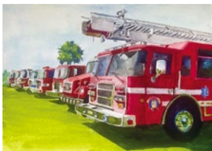
Ron Malone Bartow, FL Used Fire Truck Lot 11" x 15" $895