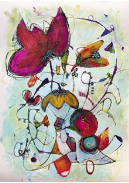
Dana Brock Plano, TX Drawing The Line 39" x 31" $1,950