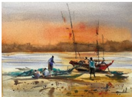
Jyotsna Umesh Chantilly, VA Fishing Time 9" x 12" $540