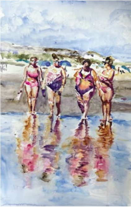
Kathleen Durdin Tampa, FL Sunset Stroll III 22" x 15" $750