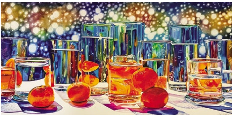
Carrie Waller Cabot, AR Effervescent Cuties 16" x 33" $4,500