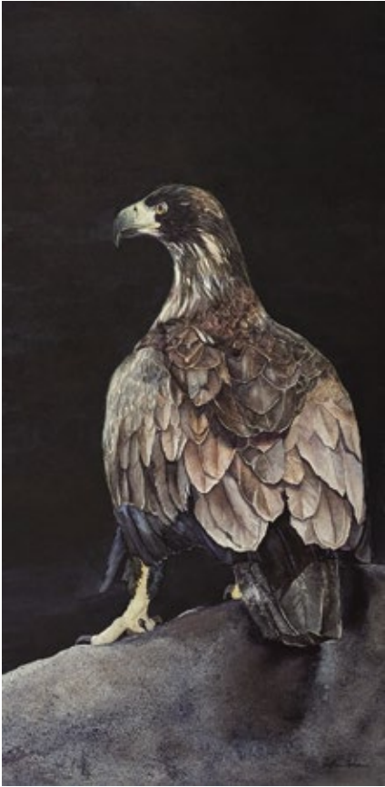
Bernadette Bradshaw Wichita, KS Birch Lake Baldy 29" x 14" $1,100