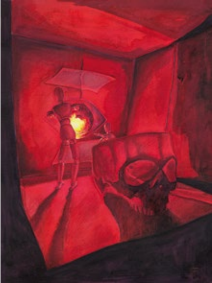
Regina Free Newkirk, OK Me, Myself and ... 23.75" x 15.5" $4,500