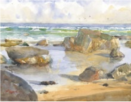
Debby Kaspari Norman, OK On Reflection 10" x 13" $475