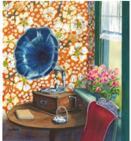
Nancy Luttrell Bel Aire, KS The Sounds of Yesterday 24" x 22" $800