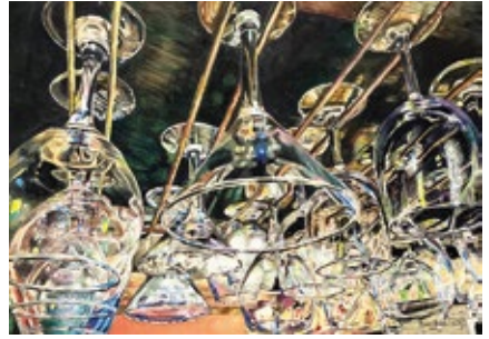
Shannon Kelly Atlanta, GA Bottoms Up 18" x 24" $1,000