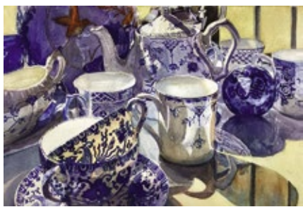
Anne Hightower-Patterson Leesville, SC Translucent Reflections 13" x 19" $1,800