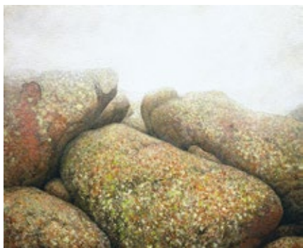
Randall Bennett Lawrence, KS Whale Rocks 18" x 22" $3,600