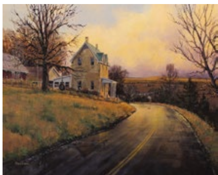
Hugh Greer Kechi, KS Evening Finale 16" x 20" $2,900