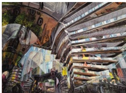
Soon Warren Fort Worth, TX Reflected City 22" x 30" $7,000