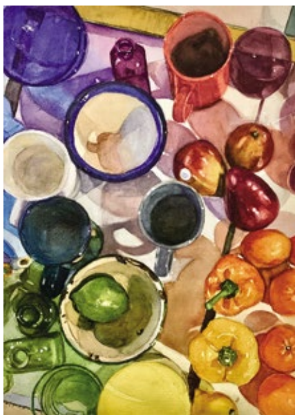
Anne Hightower-Patterson Leesville, SC Set Up Color Wheel 15.5" x 11" $1,500