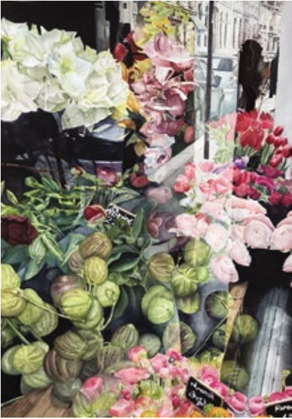
Mary Grene Andover, KS Reflecting In Paris 30" x 22" $2,150