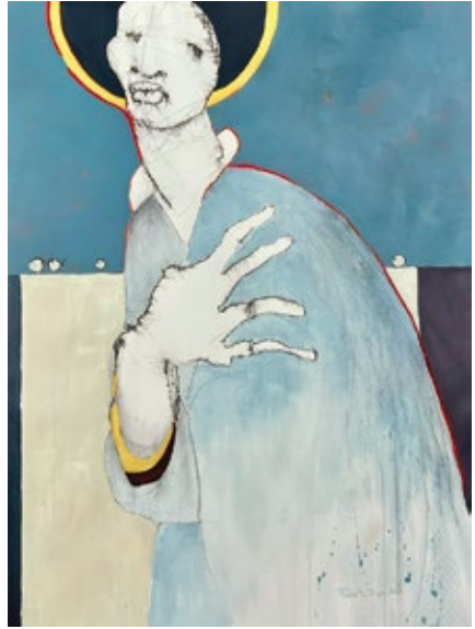
Roberta Dyer San Diego, CA Considering the Pearly Gates 30" x 22" $1,400