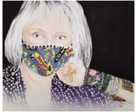
Lone Angilan Shawnee, KS Portrait of Candi- Papier colle artist 24.625" x 26.25" $600