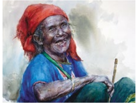
Dongfeng Li Morehead, KY Pipe Granny 21.5" x 26.5" $9,000