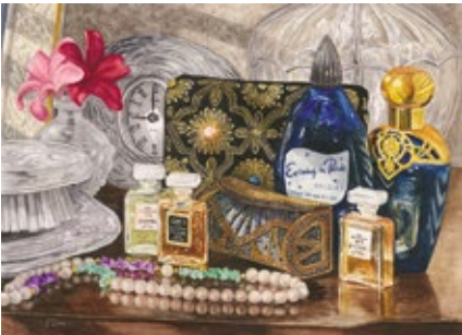
Judith Baer Salem, OR After an Evening in Paris 15" x 21" $2,000