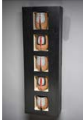
SHELDON GANSTROM Hays, KS Please, Place a Red Dot 36" x 12" x 6" $1,850