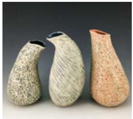
BERIT HINES Largo, FL Three Amigos 7" x 12" x 4" $150