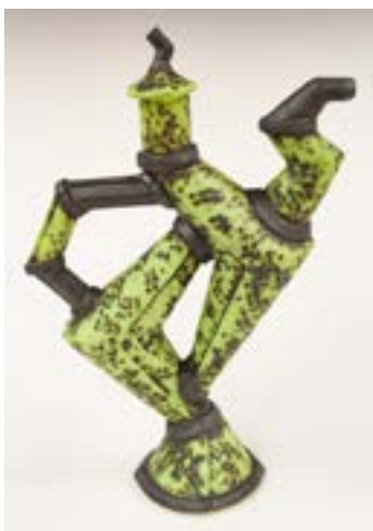
SCOTT DOOLEY Springfield, OH Teapot 13" x 9" x 4" $375