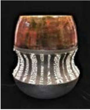
STEPHEN DURHAM Wichita, KS Untitled 2 5" x 6.25" $125