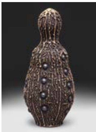
PAUL MCCOY Waco, TX Chamber IV 15" x 5" $600