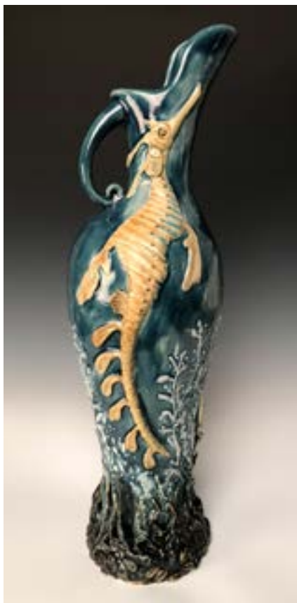
BETH THOMAS Galveston, TX Sea Dragon Ewer 18" x 5" $1,800