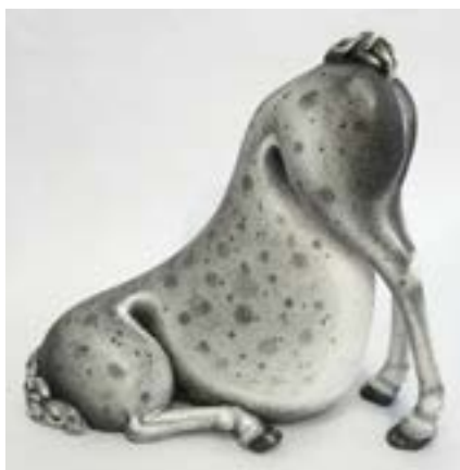
AUSTYN TAYLOR Wichita Falls, TX Zeitgeist 12" x 12" x 6" $1,700