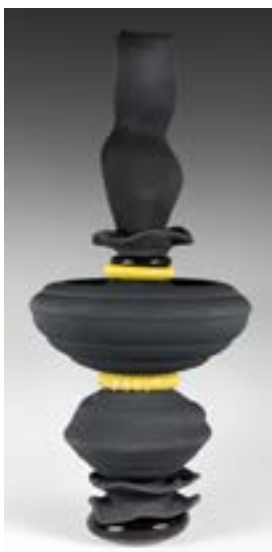
GAYLE SINGER Oklahoma City, OK Interwoven Composition #1 27.5" x 12.5" $1,200