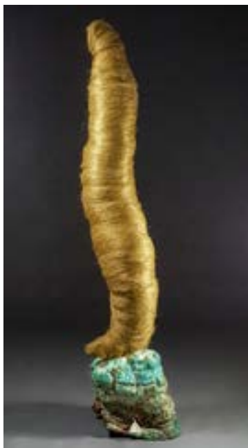
TRISH VANOSDEL Wichita, KS White Butterfly 60" x 18" x 18" $5,000