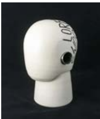
KAT DORCAS Allen, KS Placeholder (Lorem Ipsum) v. 5 8" x 5" $200