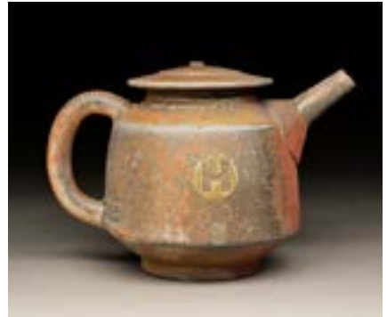
STEPHEN HEYWOOD Jacksonville, FL H-Teapot 5.5" x 7" x 5" $250