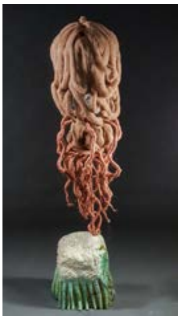
TRISH VANOSDEL Wichita, KS Cascade 72" x 28" x 28" $4,500