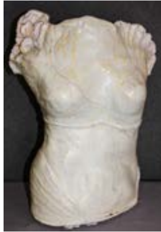
JENNIE BECKER Wichita, KS Goddess Torso 1 19" x 15" $2,000