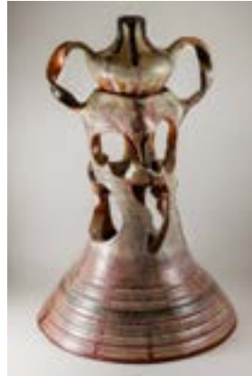
MCKINNA KRAUS Hutchinson, KS Ocular Aura 12" x 8" $160