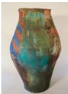
DALE HARTLEY Emporia, KS Blue Stripes 33" x 23" x 19" $3,000