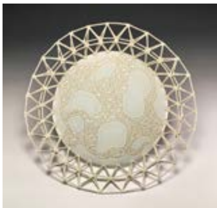
TYLER QUINTIN Topeka, KS Structure and Harmony 10" x 10" x 2" $500