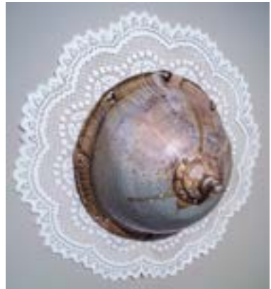
VON VENHUIZEN Lubbock, TX Metastatic Node 20" x 20" x 11" $1,900