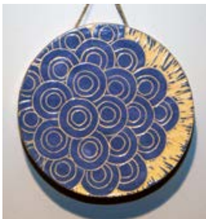
KATIE IDBEIS Wichita, KS The Gathering 10" x 2" $300