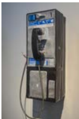
DEREK DECKER West Palm Beach, FL Life Line 23" x 9" $3,000