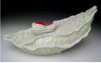
KYOUNGHWA OH Grand Junction, CO Influenced XXII 8.5" x 13" x 6" $1,200