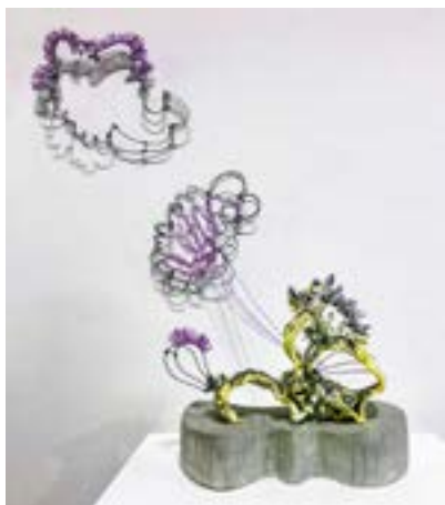
STEPHANIE LANTER Emporia, KS Unsaid 38" x 22" x 16" $1,400