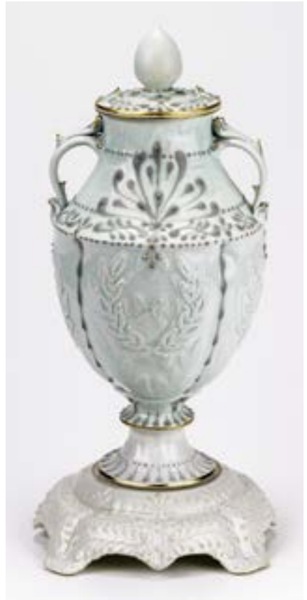
MICHAEL STUMBRAS Carbondale, IL Heart Burial Urn 13" x 6" x 6" $925