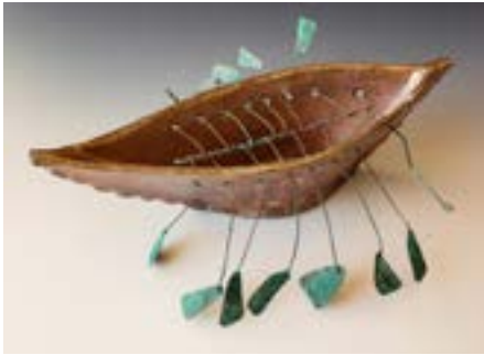
JESSE BAGGETT Wichita Falls, TX Oared Vessel 12" x 12" x 4" $220