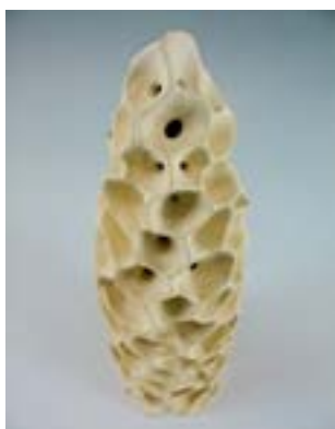
ELIZABETH SHRIVER Coralville, IA Short Bubble Form 14" x 4" x 4" $650