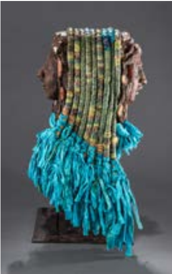
AIMEE PEREZ Miami, FL Aguila Bicefala 25" x 18" x 12" $4,500