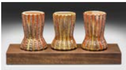
PAUL MCCOY Waco, TX Triptych I 8" x 18" x 6.5" $600