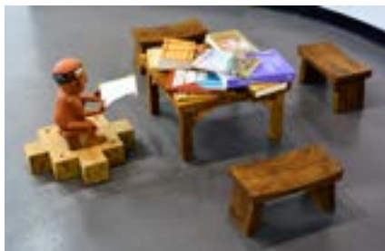
MARIO MUTIS Gainesville, FL Ukansuka 14" x 90" x 90" $2,312