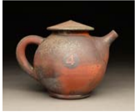
STEPHEN HEYWOOD Jacksonville, FL 4-Teapot 6" x 8" x 5" $250