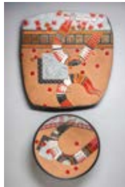
SHELDON GANSTROM Hays, KS Show Me the Place 42" x 21.5" $2,500