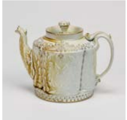
MICHAEL STUMBRAS Carbondale, IL Empty Set Canister Teapot 7" x 9" x 6" $675