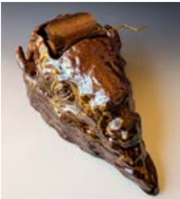
JESSE BAGGETT Wichita Falls, TX Perception 12" x 8" x 8" $1,000