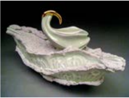
KYOUNGHWA OH Grand Junction, CO Influenced Gold #2 7" x 12" x 5.5" $1,200