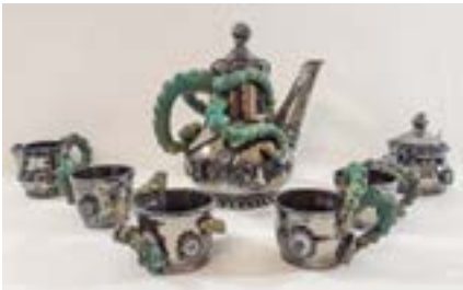
JOSH HEIMSOTH Sedalia, MO Tentacle Tea Set 18" x 18" x 10" $2,000