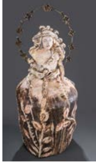
AIMEE PEREZ Miami, FL The Cloud Maker 22" x 13" x 13" $3,500