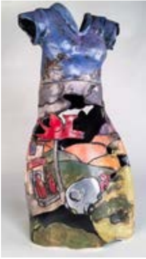
BRENDA JONES South Fork, CO Road Trip 26" x 15" x 15" $950