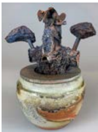
BILL RANEY Waco, TX Dusty Too 9" x 7" $750