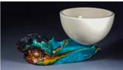
BRUCE VANOSDEL Wichita, KS Wave Crest 12" x 10" x 20" $1,600