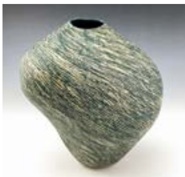
BERIT HINES Largo, FL Vase Cyclone 9" x 8" x 6" $175