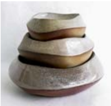
EMMA KAYE Philadelphia, PA Totem Bowls Sm: 5.5" x 5.5" x 2.75" Med: 7" x 7" x 3" Lg: 9" x 9" x 3.75" $425