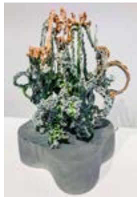
STEPHANIE LANTER Emporia, KS Right (Now) 23" x 14" x 13" $1,600