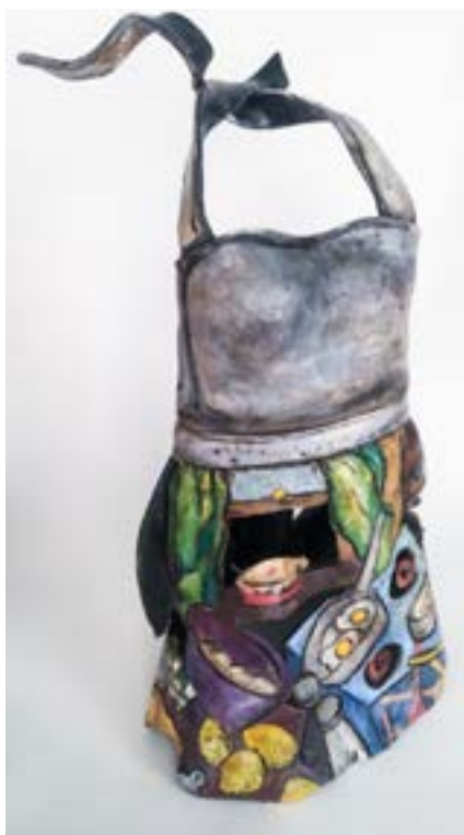
BRENDA JONES South Fork, CO Kitchen Still Life 25" x 18" x 18" $950