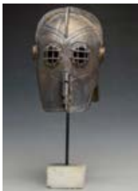
DEREK DECKER West Palm Beach, FL Smoke Mask 22.25" x 9" x 8" $2,500