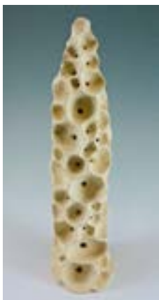
ELIZABETH SHRIVER Coralville, IA Tall Bubble Form 19" x 5" x 5" $850