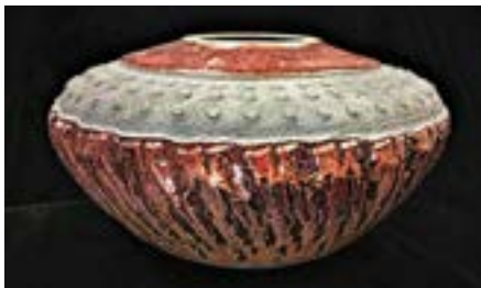
STEPHEN DURHAM Wichita, KS Untitled 1 4" x 7" $150