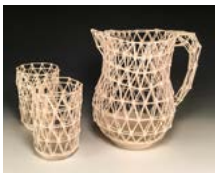
TYLER QUINTIN Topeka, KS Object Memory 2 (Long Summer Days) 9" x 16" x 10" $2,000