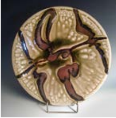
CHRIS ARENSDORF Topeka, KS Platter 14" x 3" $200