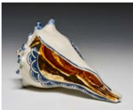
SARAH PETTY Fairfax, VA Homesick 5" x 5.75" x 8.25" $2,000