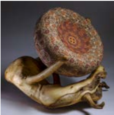
JAMIE SMITH Courtois, MO Turtle Earth 18" x 16" $3,600