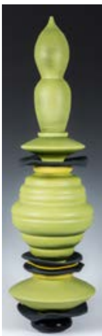
GAYLE SINGER Oklahoma City, OK Interwoven Composition #3 35.5" x 15" $1,200