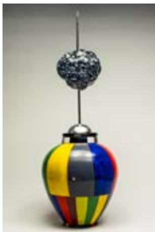
SAM MENDEZ Gainesville, FL Static 8" x 8" x 23.5" $650