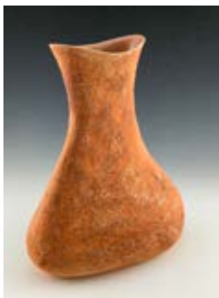
BERIT HINES Largo, FL Vase Twilight 11" x 10" x 3.5" $375