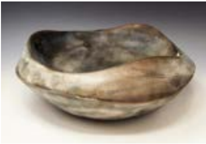
EMMA KAYE Philadelphia, PA Stormy Bowl 13.5" x 13.5" x 5.75" $375