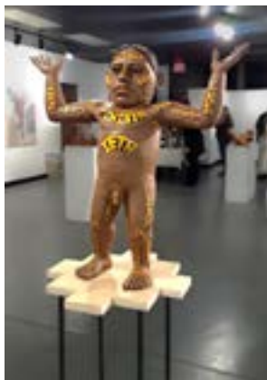
MARIO MUTIS Gainesville, FL Muyscubun 64" x 24" x 12" $2,312