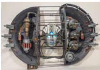
JOSH HEIMSOOTH Sedalia, MO Alternative Power 40" x 26" x 10" $5,000