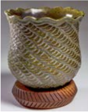
JAMIE SMITH Courtois, MO Corrugated Vessel 8" x 6.5" $1,800