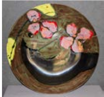
JENNIE BECKER Wichita, KS Stay the Course 22" x 22" $1,000