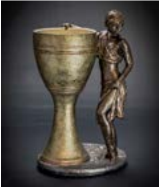
PATTI FOX Shell Lake, WI Doctor's Orders, One Glass a Day 17" x 10" $1,600