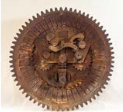
JOSH HEIMSOTH Sedalia, MO Rusty Platter 25" x 25" x 5" $1,800