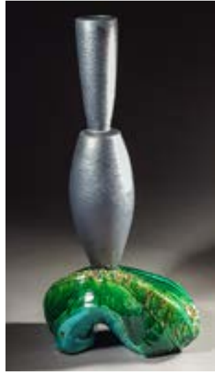
BRUCE VANOSDEL Wichita, KS On the Edge 28" x 8" x 12" $1,600