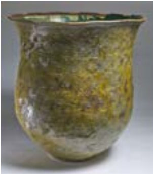
JAMIE SMITH Courtois, MO Moundbuilder Style Stamped Vessel 19" x 17.75" $5,200