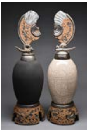
SHELDON GANSTROM Hays, KS Twins 28" x 18" x 9" $2,500