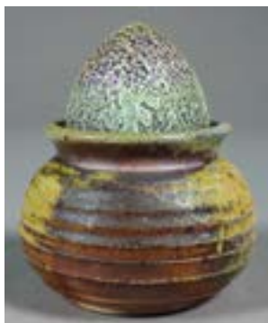
BILL RANEY Waco, TX F in Ceramics 7" x 6" $750