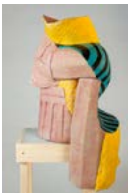
GARET REYNEK Wichita, KS Espy 4 36" x 24" x 20" $1,100