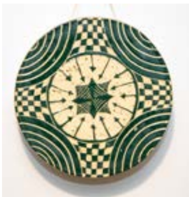
KATIE IDBEIS Wichita, KS Down the Rabbit Hole 10" x 2" $300